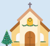
Greening the Church Dec. 21