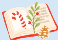
Lessons & Carols Dec. 14