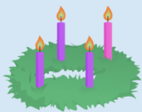
Advent Wreath Making Dec. 3