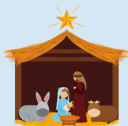
Crèche Display Dec. 10