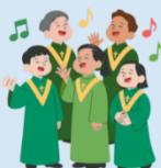
Evensong & Pageant, Midnight Mass Dec. 24

Dec. 3 @ 5:30pm: Advent Wreath Making , bring greenery + clippers